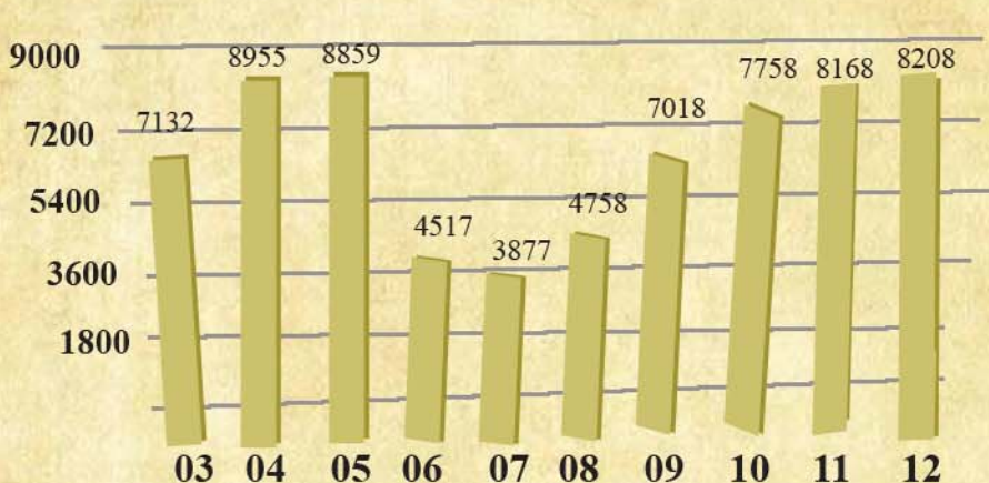
Collier County Foreclosures